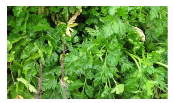
last year's parsley perking up