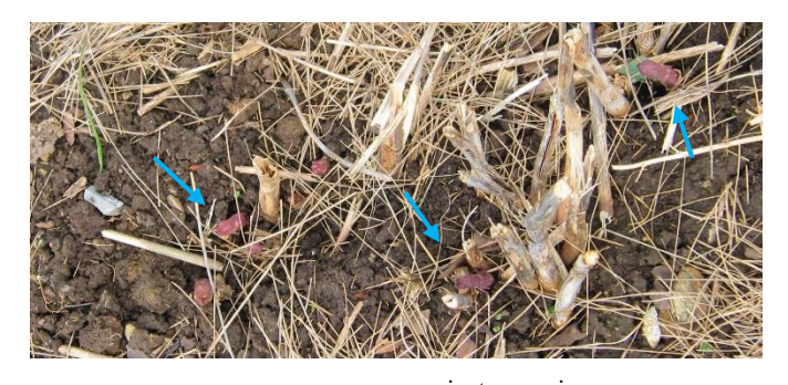
asparagus spears just emerging (see blue arrows)