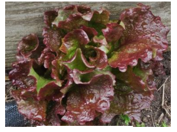
red leaf lettuce