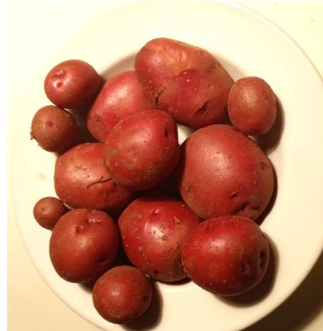
harvest from one small seed potato