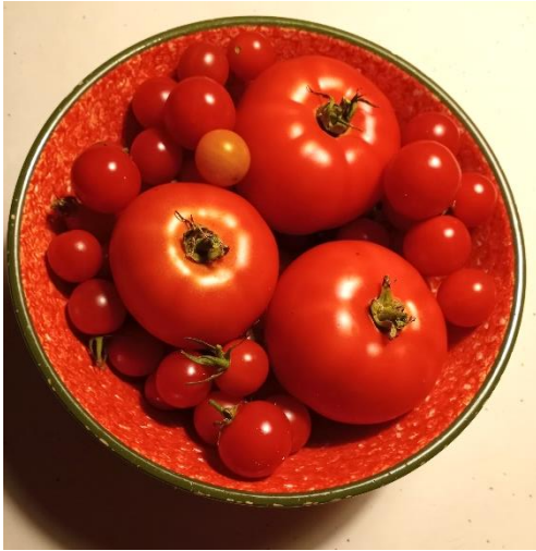
one plots' one day tomato harvest